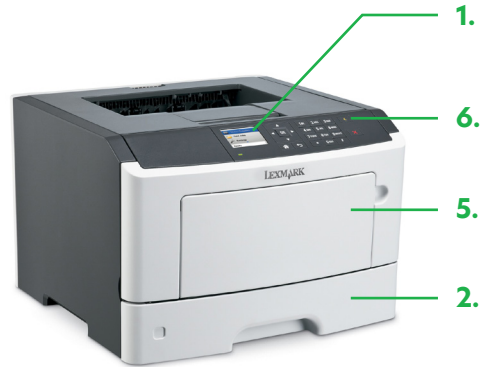
M1140+ or M1145 with 6 cm (2.4-inch) LCD display