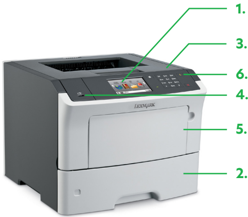
M3150 with 10.9 cm (4.3-inch) colour touch screen